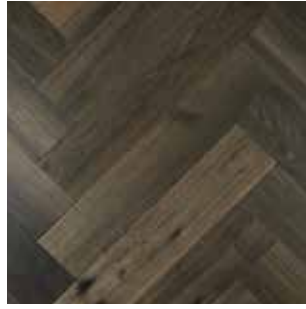
Ash Grey (15/4mm Only)

Images for illustrative purposes only, batch and grade variations will occur.