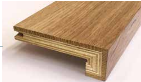
T&G Stair Nosing

If stairs are involved it's wise to spend time discussing nosing & trim requirements prior to purchase. These images are for illustrative purposes only.