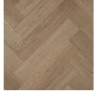
Parana (15/4mm Only)