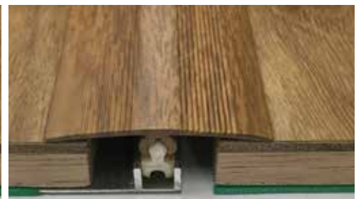
Expansion / Transition