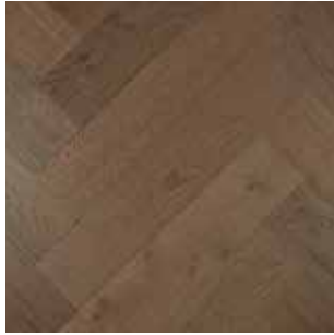
Dark Brown (15/4mm Only)