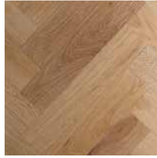
Cabernet (21/6mm Only)