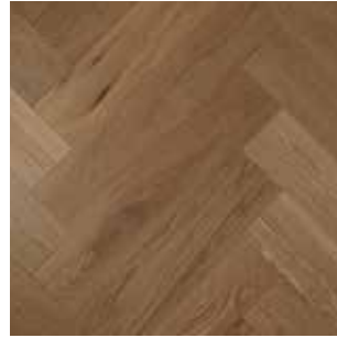
Latte (15/4mm Only)