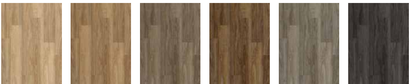
520 Spotted Gum Blonde 530 Spotted Gum Coastal 540 Spotted Gum Riverbank 555 Spotted Gum Natural 710 Spotted Gum Ash 790 Spotted Gum Burnt