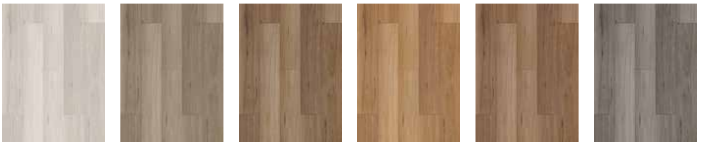
105 Blackbutt Ivory 505 Blackbutt Limed 525 Blackbutt Sandbank 535 Blackbutt Elegant 545 Blackbutt Classic 735 Blackbutt Stormy